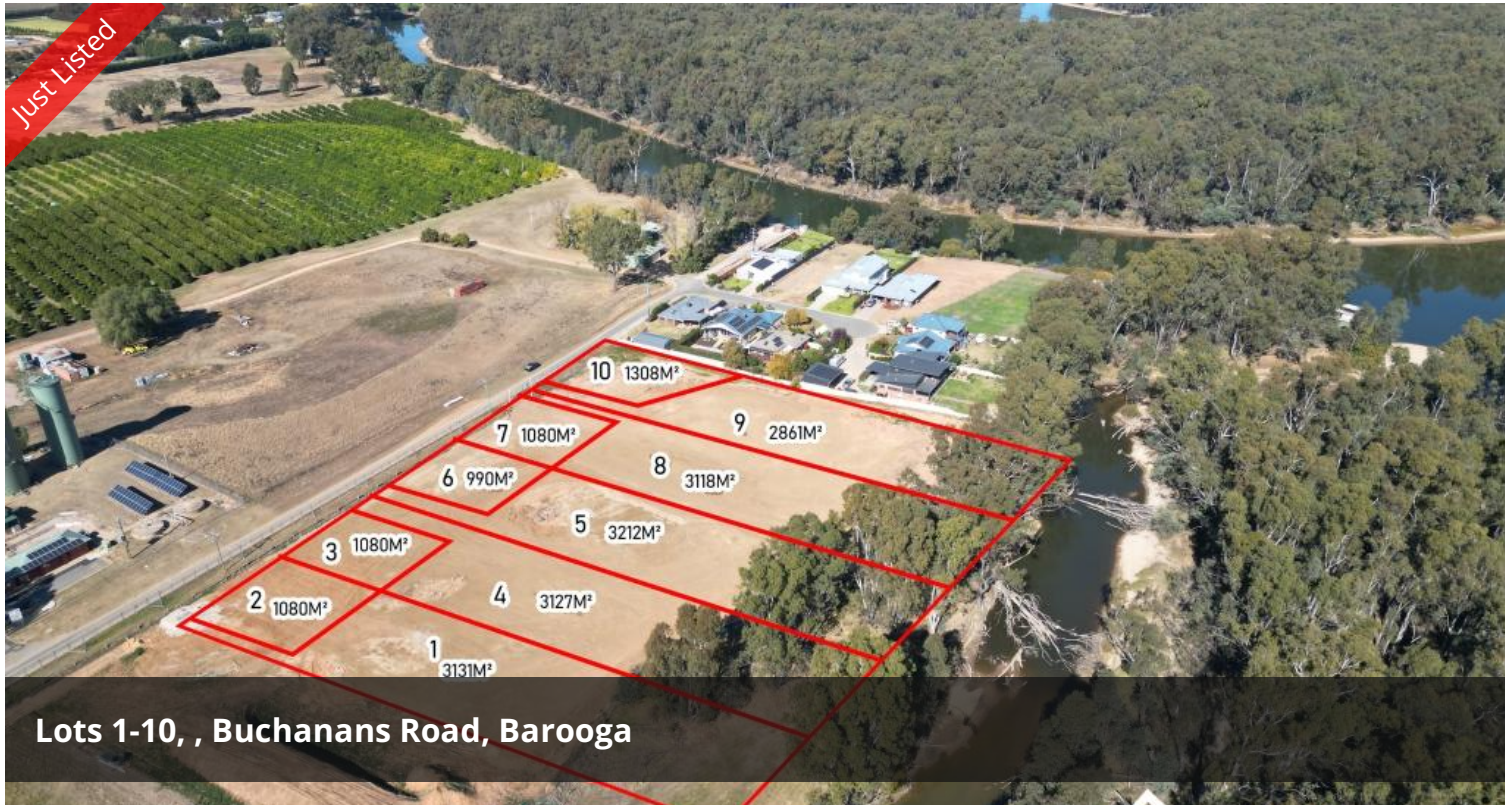
Lots 1-10, , Buchanans Road, Barooga