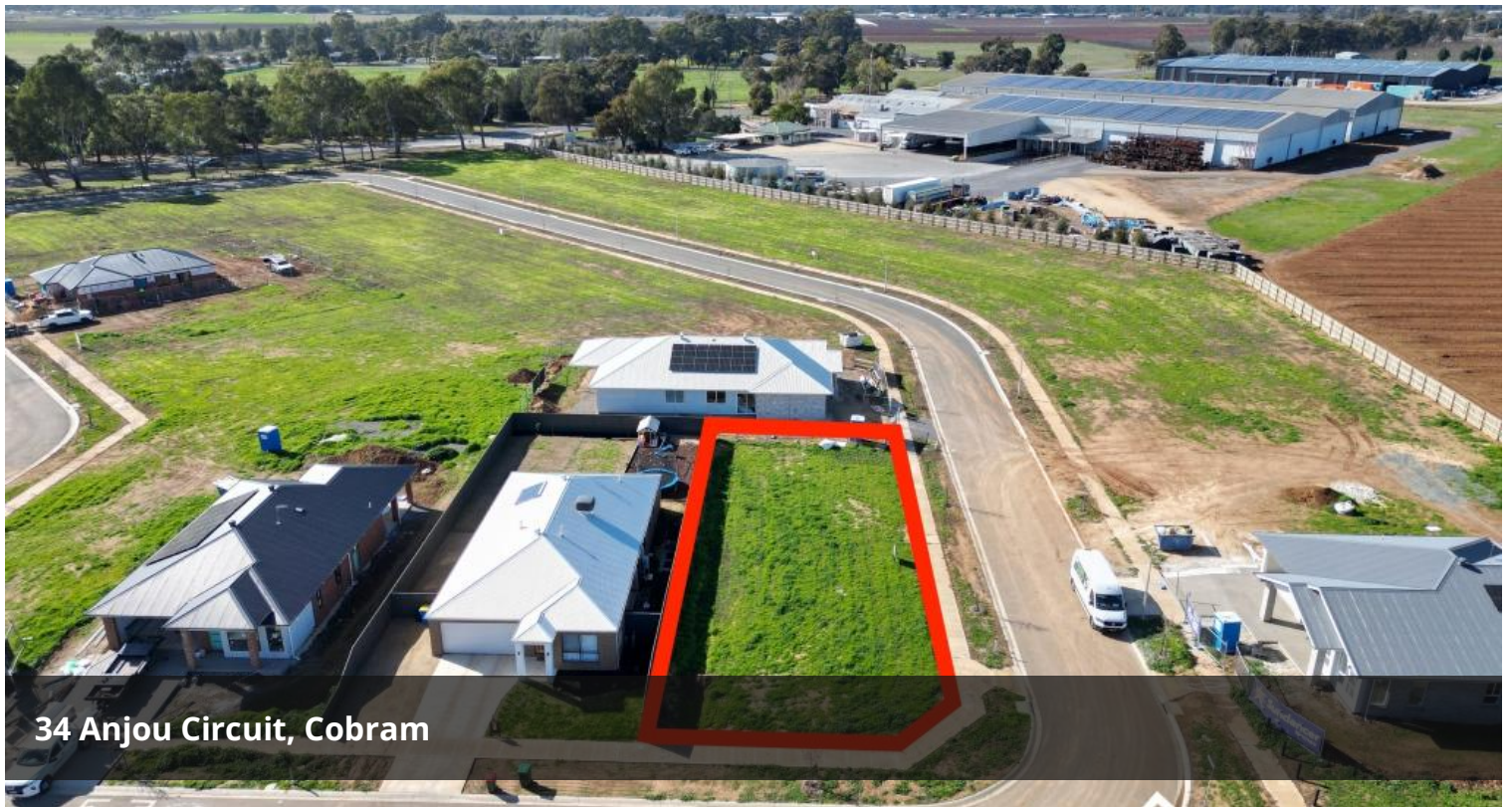
34 Anjou Circuit, Cobram