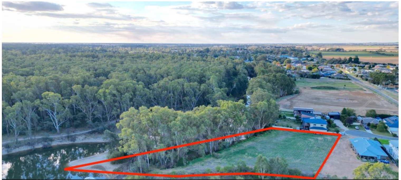
3 Riverview Court, Barooga