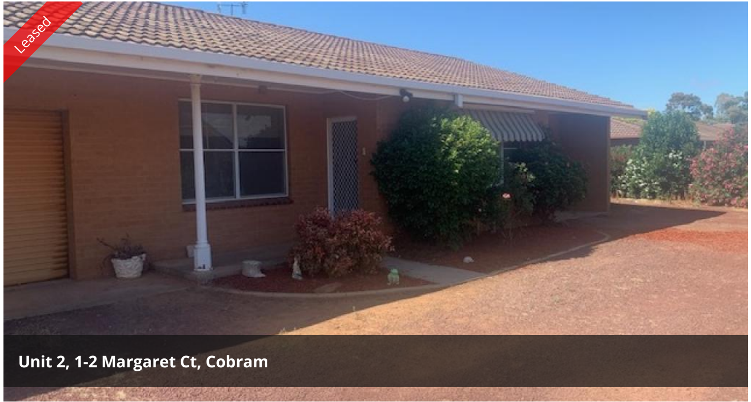
Unit 2, 1-2 Margaret Ct, Cobram