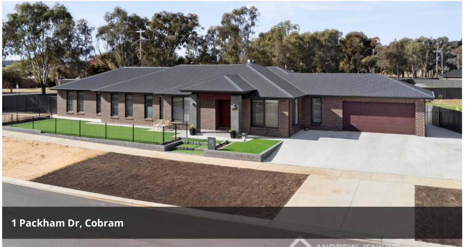
1 Packham Dr, Cobram