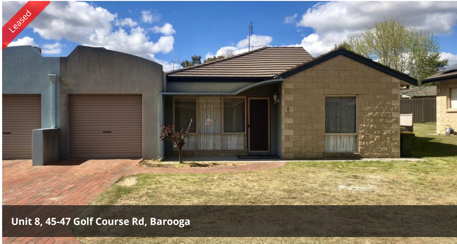
Unit 8, 45-47 Golf Course Rd, Barooga