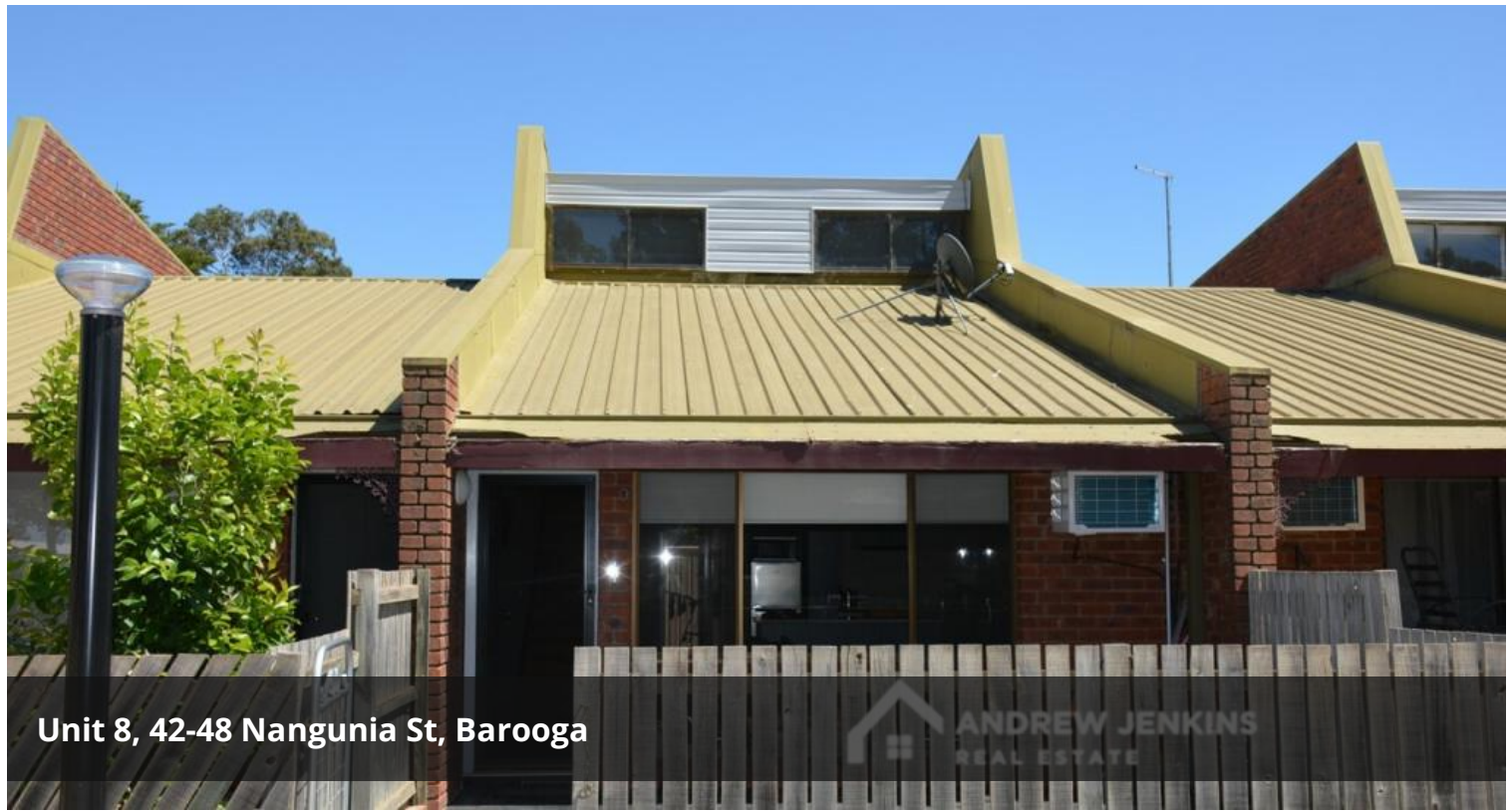
Unit 8, 42-48 Nangunia St, Barooga