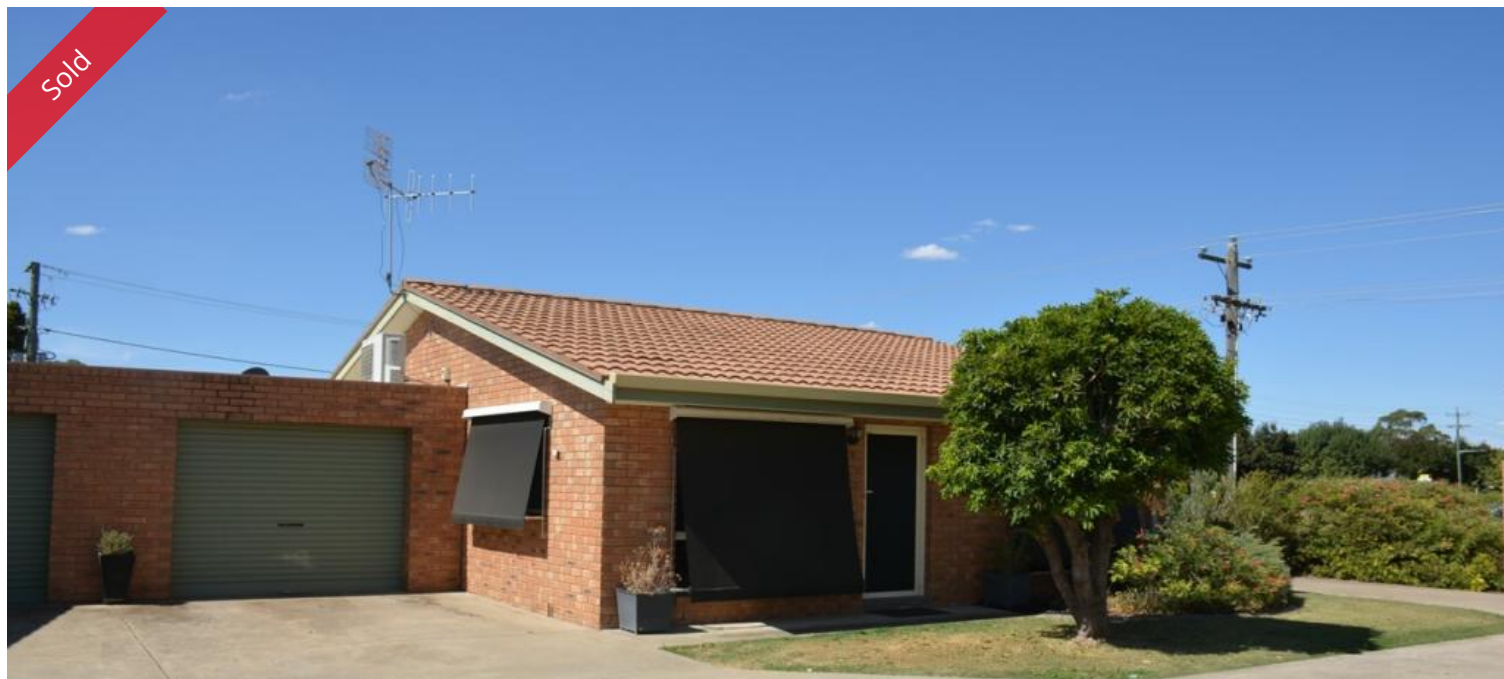
Unit 4, 58-60 Collie St, Barooga