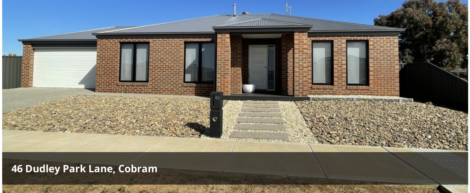
46 Dudley Park Lane, Cobram