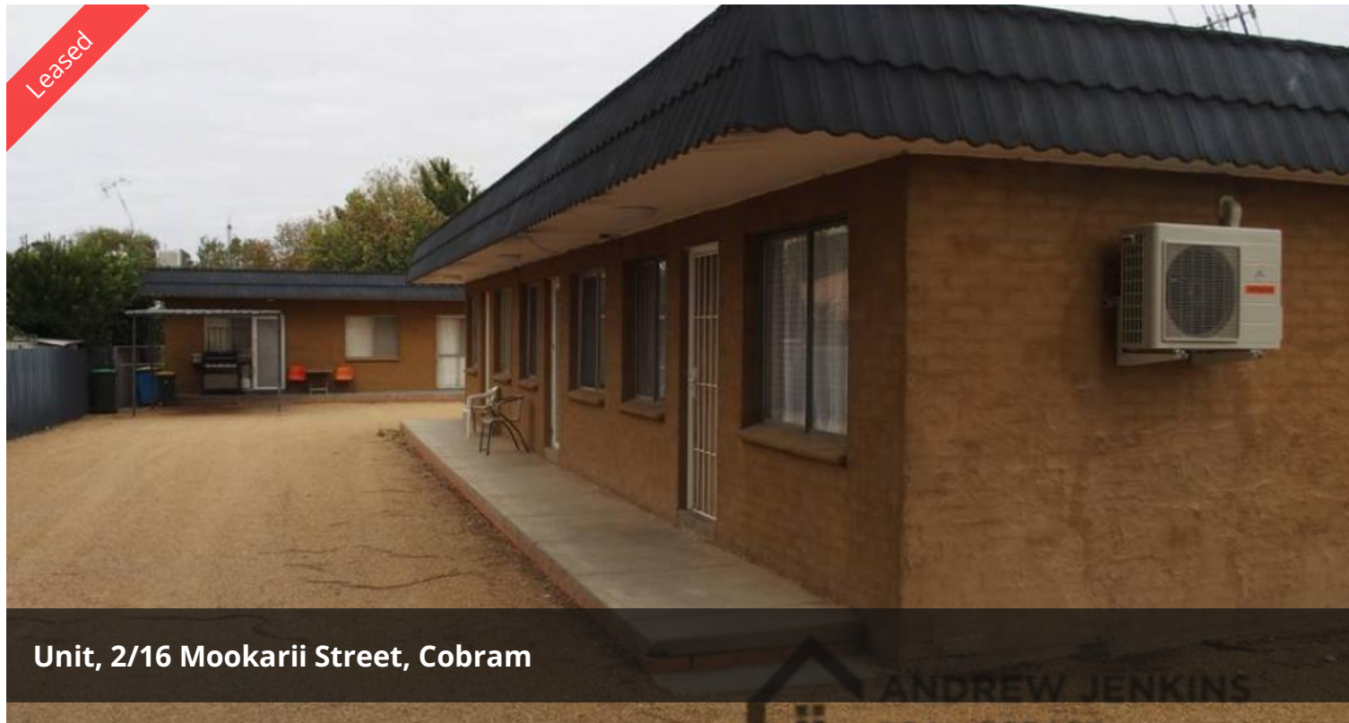
Unit, 2/16 Mookarii Street, Cobram