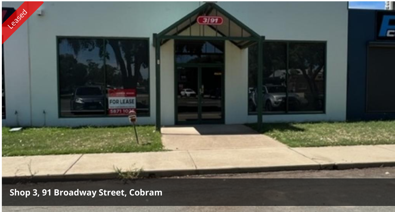
Shop 3, 91 Broadway Street, Cobram