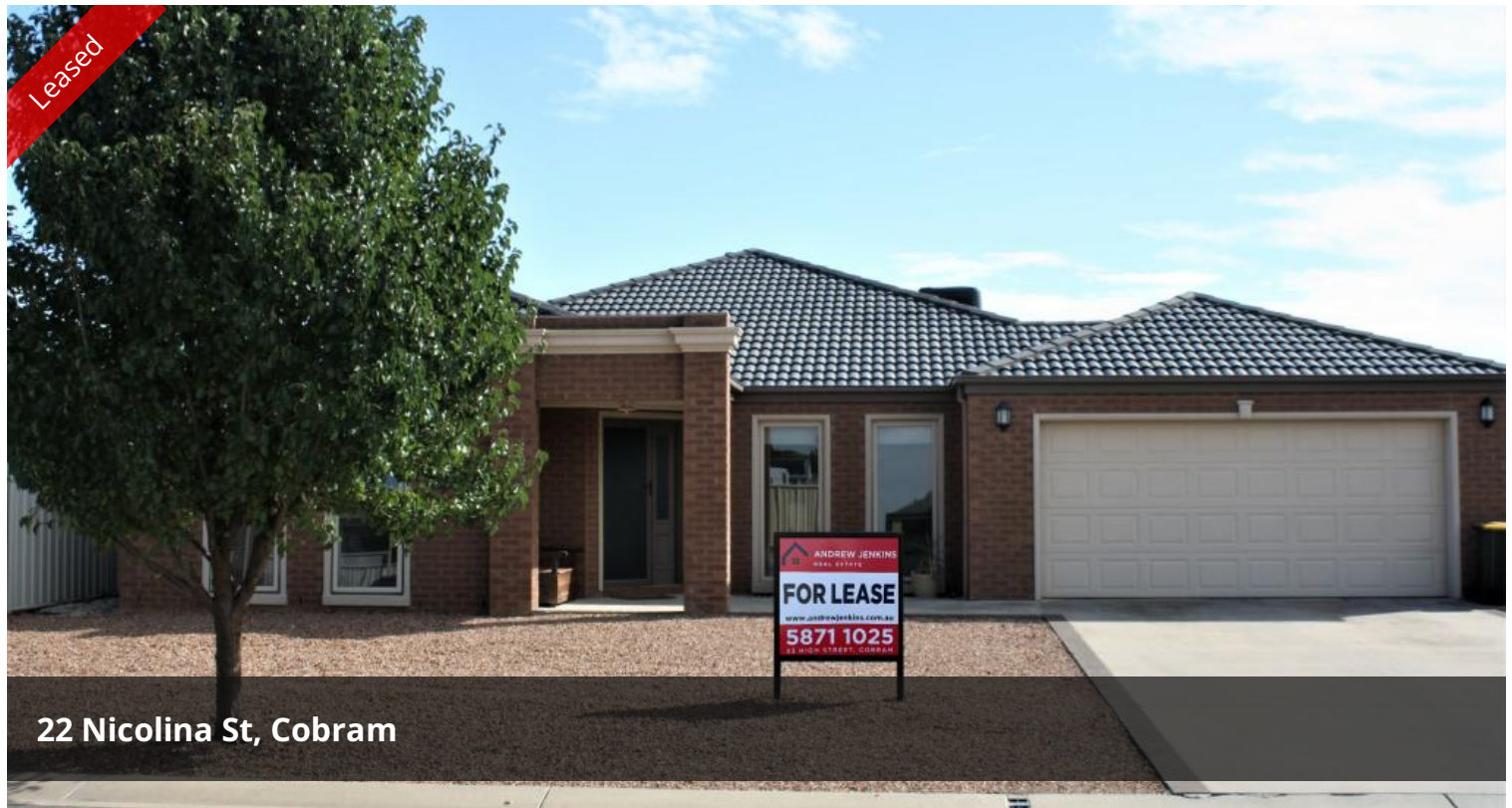
22 Nicolina St, Cobram