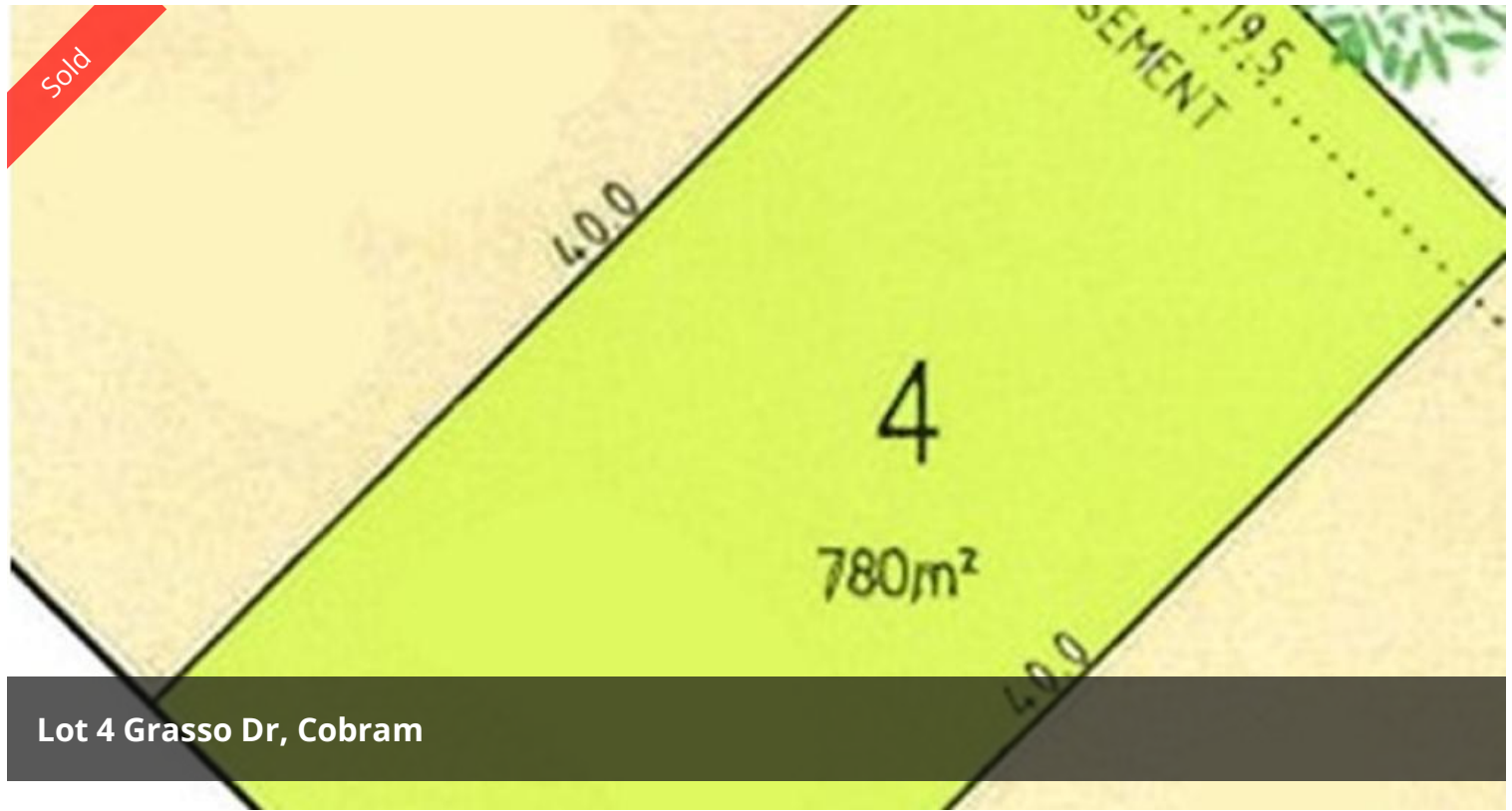
Lot 4 Grasso Dr, Cobram