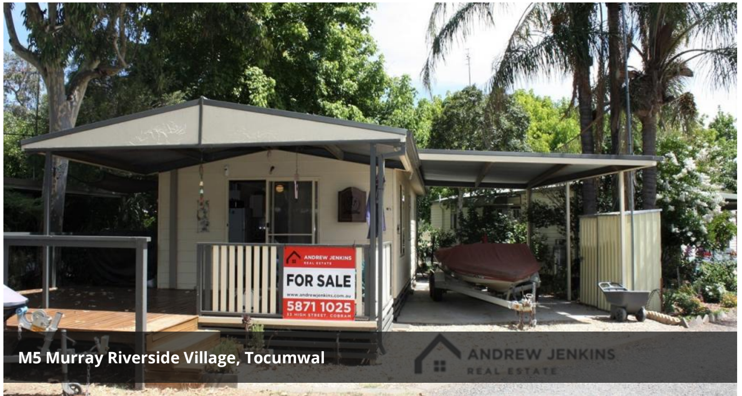
M5 Murray Riverside Village, Tocumwal