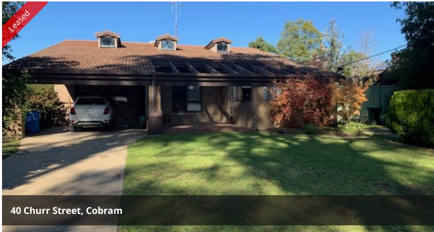
40 Churr Street, Cobram