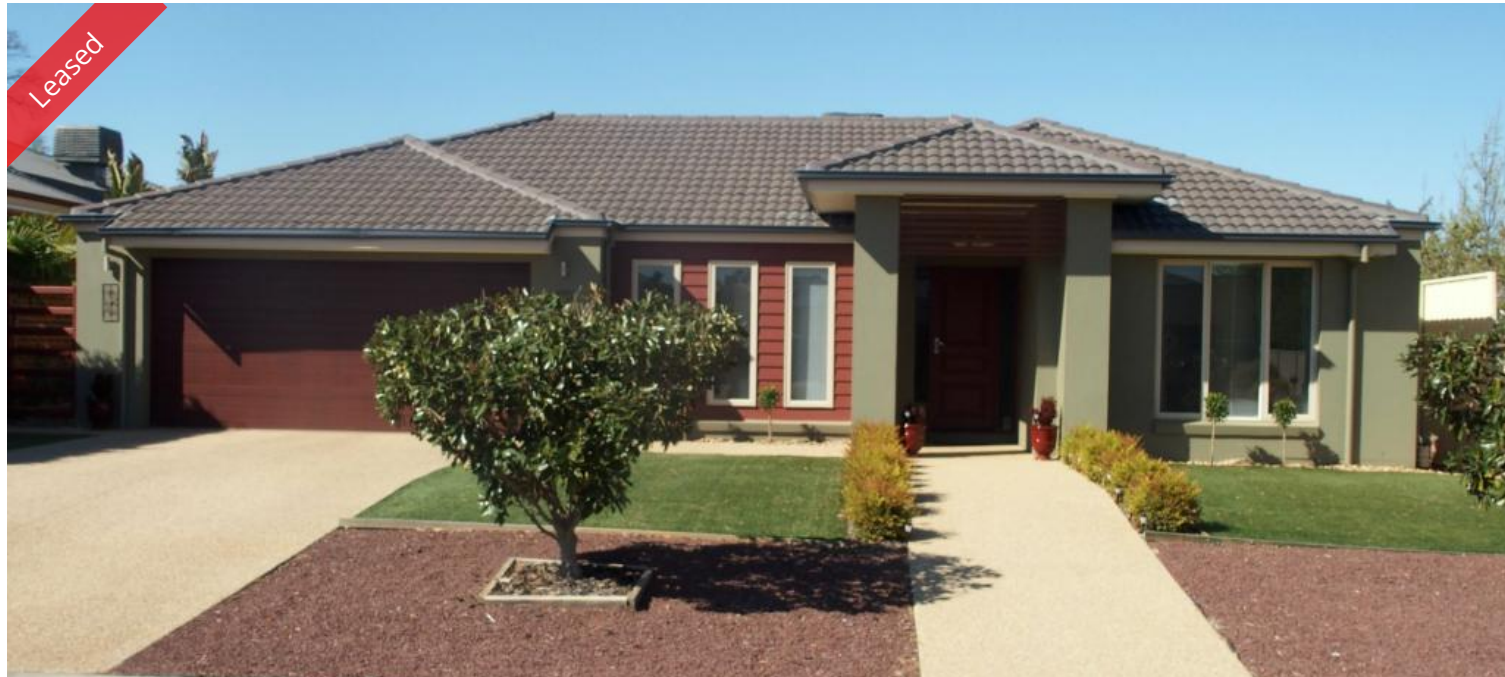
7 Alexander Court, Cobram