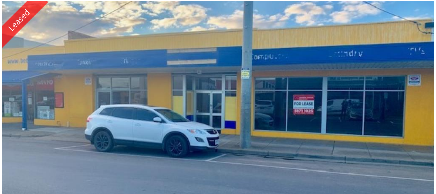
10 Main St, Cobram