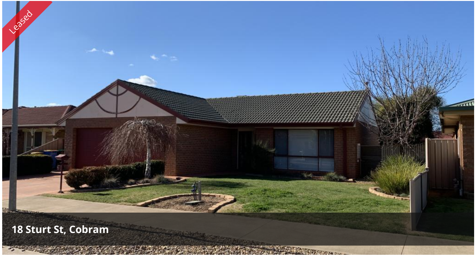
18 Sturt St, Cobram