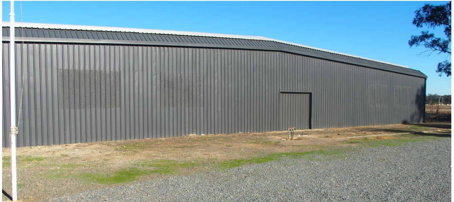
Lot 1 Cobram Koonoomoo Road, Cobram