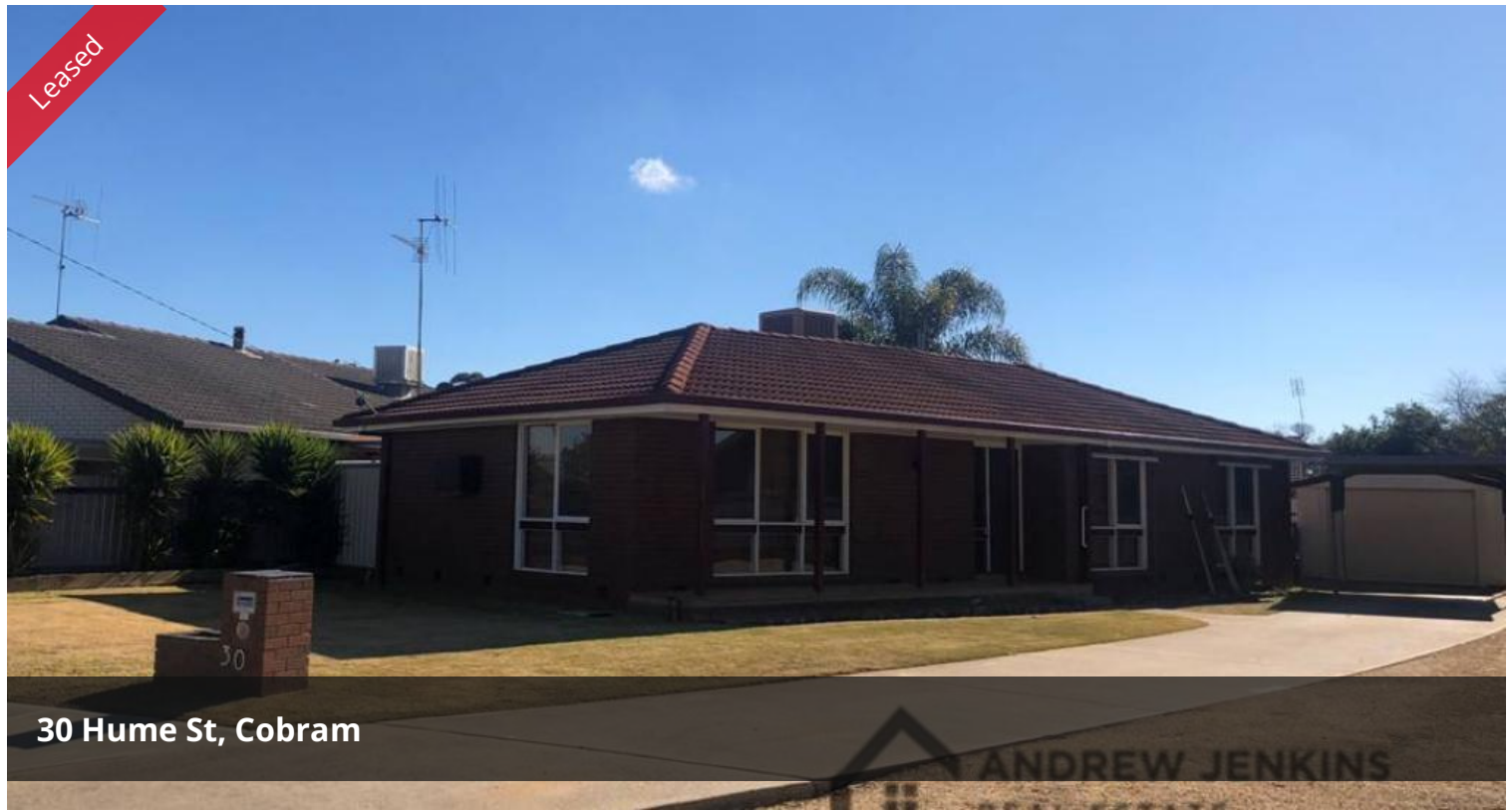
30 Hume St, Cobram