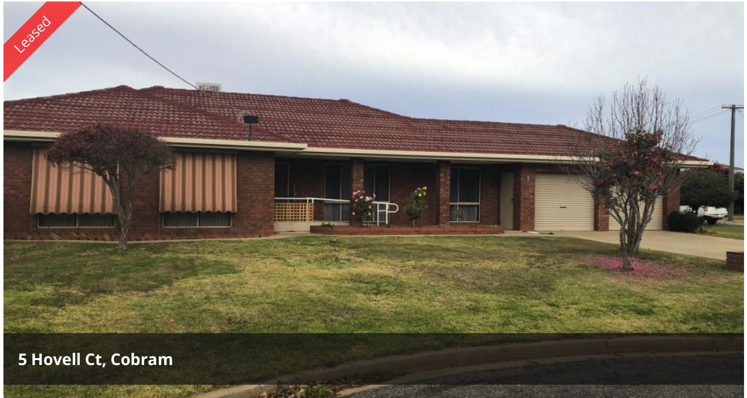
5 Hovell Ct, Cobram