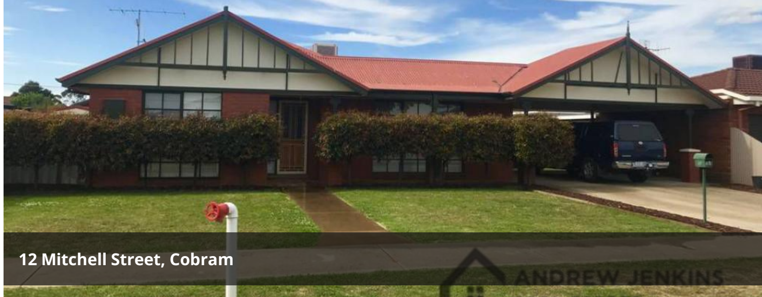
12 Mitchell Street, Cobram