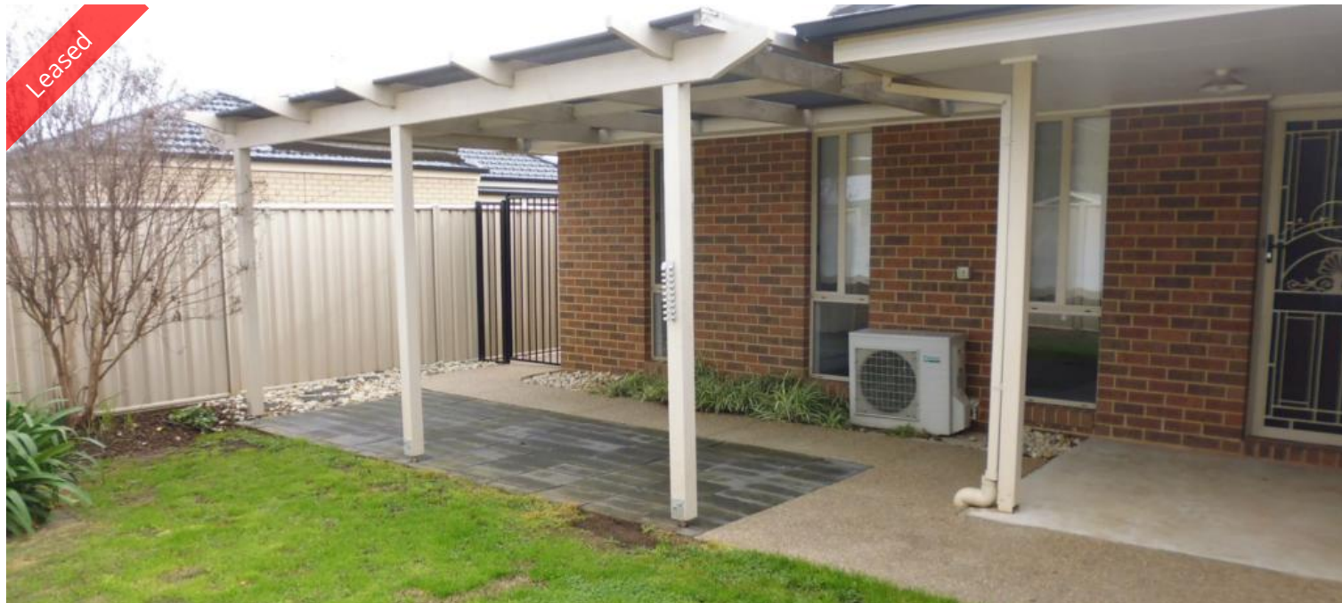
Unit 2, 7 - 9 Sledmere Avenue, Cobram