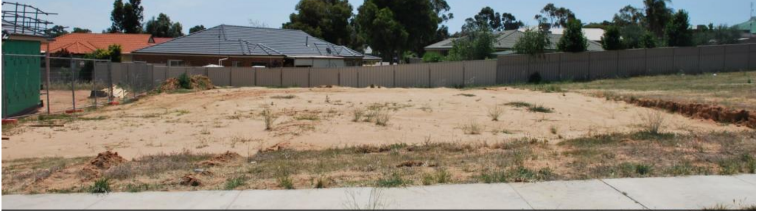
Lot 188 Villa Court, Cobram